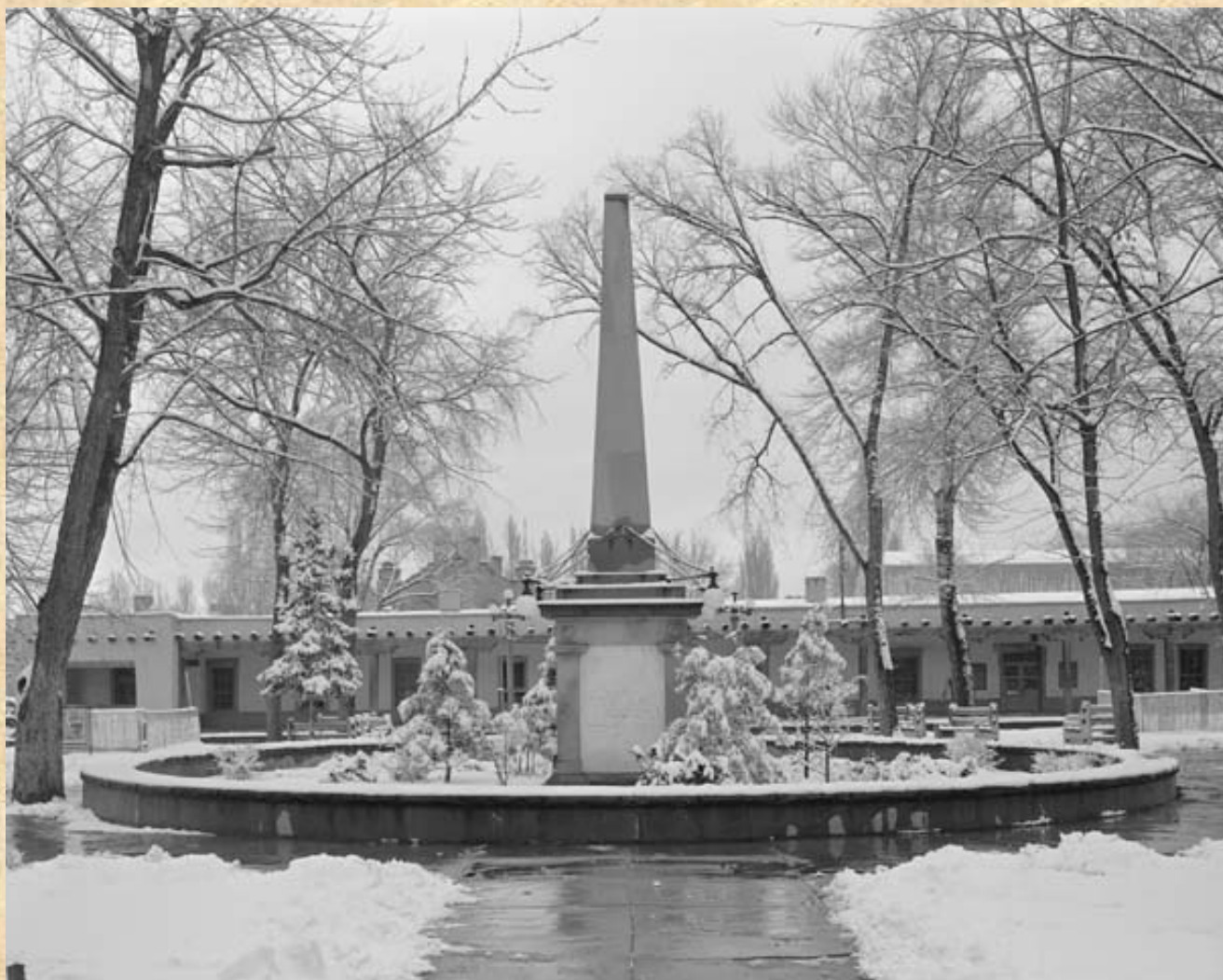
Santa Fe Plaza, 1942 - Item 001466, Collection 1987-066: New Mexico Department of Tourism Photograph Collection. New Mexico State Records Center and Archives.