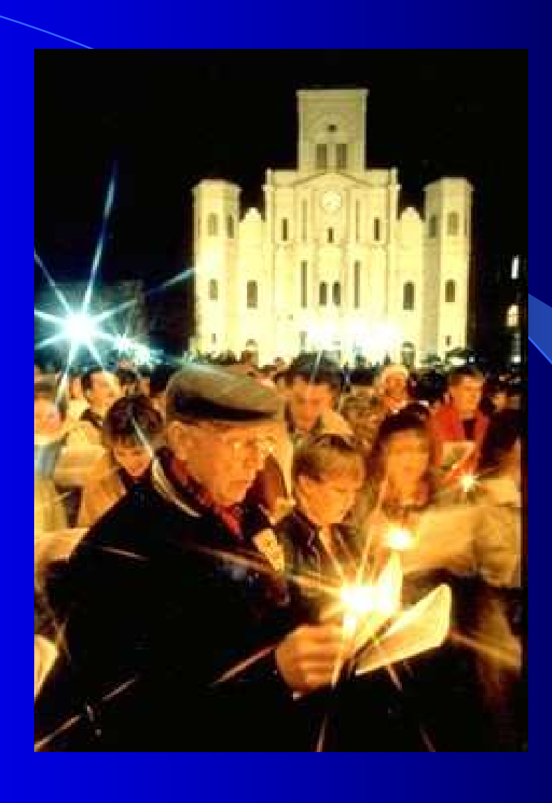
Candlelight caroling during Christmas New Orleans Style in Jackson Square